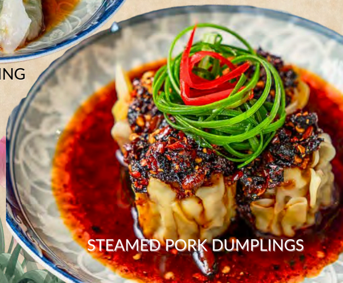
STEAMED PORK DUMPLINGS