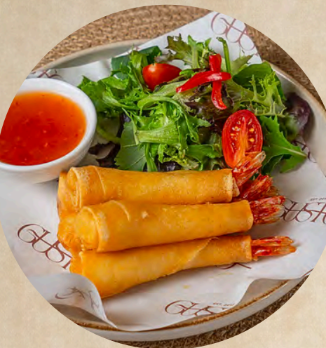
PRAWN SPRING ROLL