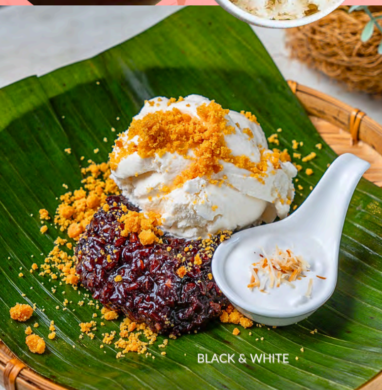
BLACK & WHITE