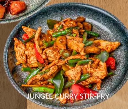
JUNGLE CURRY STIR-FRY