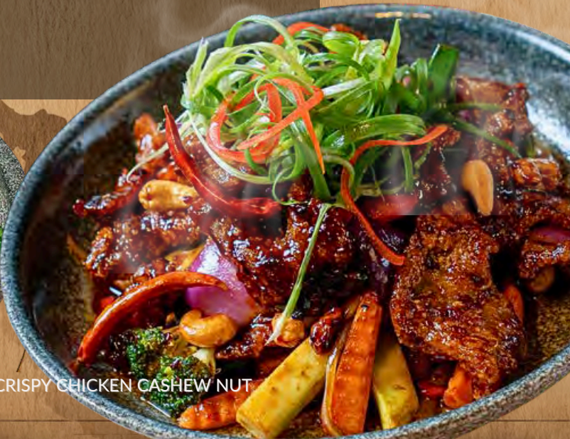
CRISPY CHICKEN CASHEW NUT