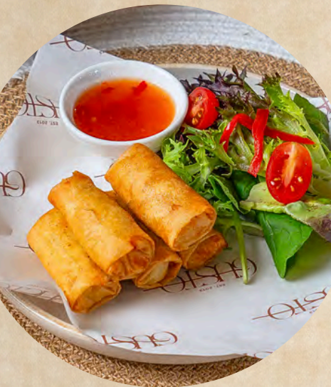
VEGETABLE SPRING ROLL