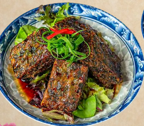
FRIED CHIVE DUMPLINGS

golden spring rolls filled with prawns, served with house made sweet chilli sauce.