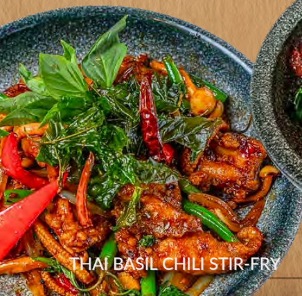
THAI BASIL CHILI STIR-FRY