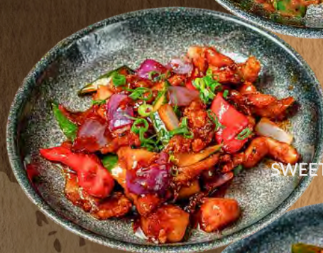
SWEET AND SOUR